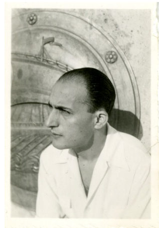
The poet at 28 years old, 1939-40

Nikos Gatsos (1911-1992) had a profound influence on the post-war generation of Greek poets. Writing of both loss and hope, Gatsos's unique blend of surrealism, symbolism and folk song created intense admiration and assured his place alongside his friends, Nobel laureates Odysseas Elytis and George Seferis, as one of the great twentieth-century Greek poets.